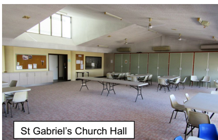
St Gabriel's Church Hall

Social evenings are held several times a year. These evenings include a 'bring and share' meal, a time of fellowship, and an opportunity to invite our friends and family for a relaxing evening at the church.