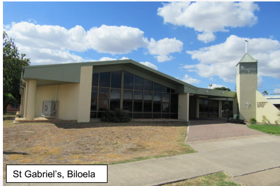
St Gabriel's, Biloela

Biloela has a roster supporting various duties including readers, flower arranging, morning tea following the service, welcomers, offertory duties, mowing and power point. We also have a sacristan who sets up for each service for the Eucharist. We employ an office worker, who, each week, prepares the pew sheet and power point for the Sunday service which is projected on the wall (at St Gabriel's).