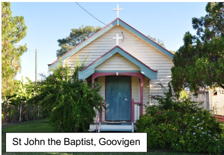
St John the Baptist, Goovigen

St Christopher's at Jambin, 20kms from Biloela, currently meets for worship on the at 10.30am on the first Sunday of each month.