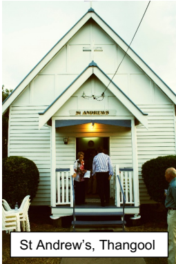
St Andrew's, Thangool

St Andrew's at Thangool, 11kms out of Biloela, currently worships twice a month on the first Saturday at 6.00pm and third Sunday at 10.30am.